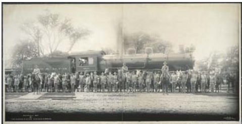
World's largest engine, Chicago & Alton RR 1907