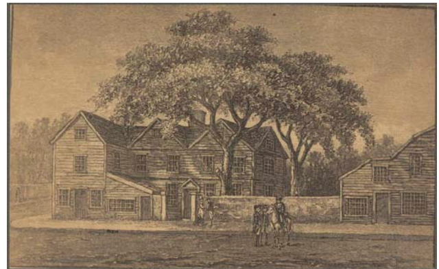
The Liberty Tree

Who Was Who 1971-80 , vol VII, Adam & Charles Black, London, 1981