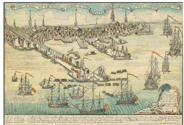
British warships arrive in Boston 1768