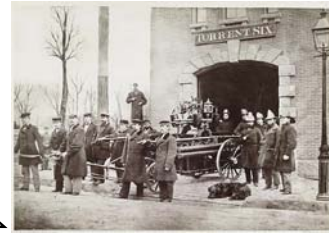
Eustis St. Firehouse 1859